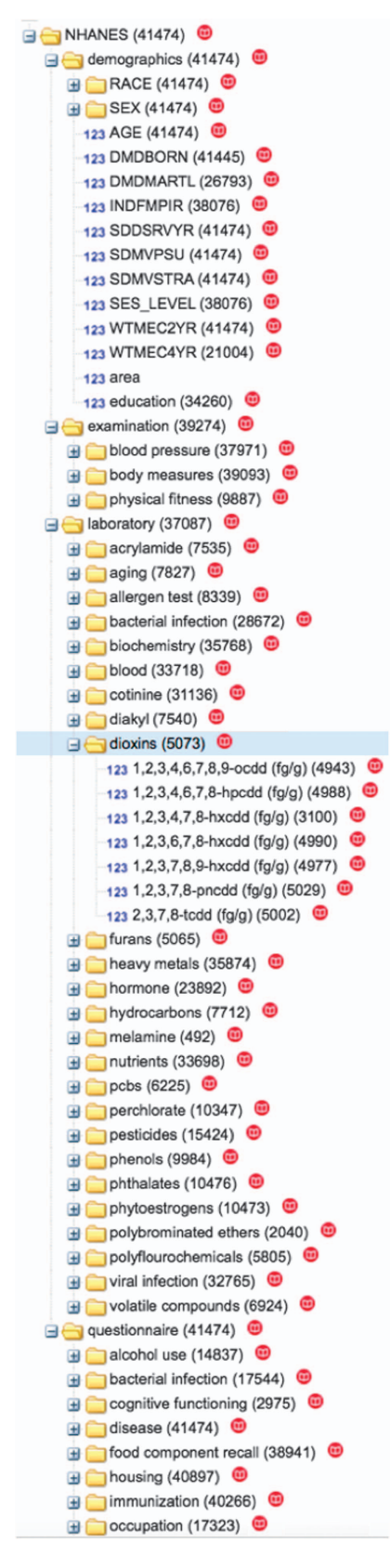
Figure 2. Screenshot of NHANES data hierarchy displayed in the PIC data browser tool. Variables are shown with sample sizes. Highlighted in the screen shot are all laboratory measures of dioxins, a type of environmental exposure assayed in serum.